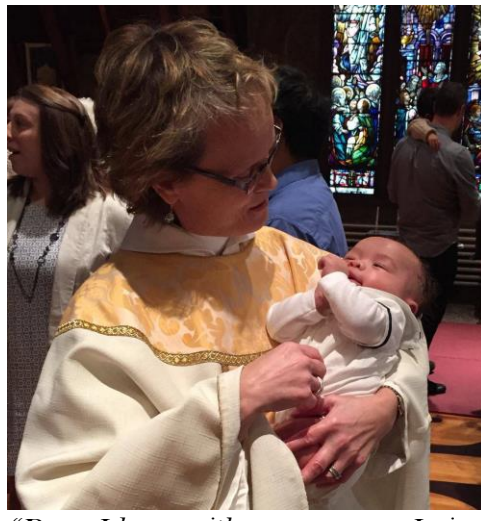
"Peace I leave with you; my peace I give to you. I do not give to you as the world gives. Do not let your hearts be troubled, and do not let them be afraid."

Often in these tragic times people call out "Where is God?" "Why didn't God stop this terrible thing from happening?" I remember a cartoon I saw once, where a young man was sitting on a park bench with