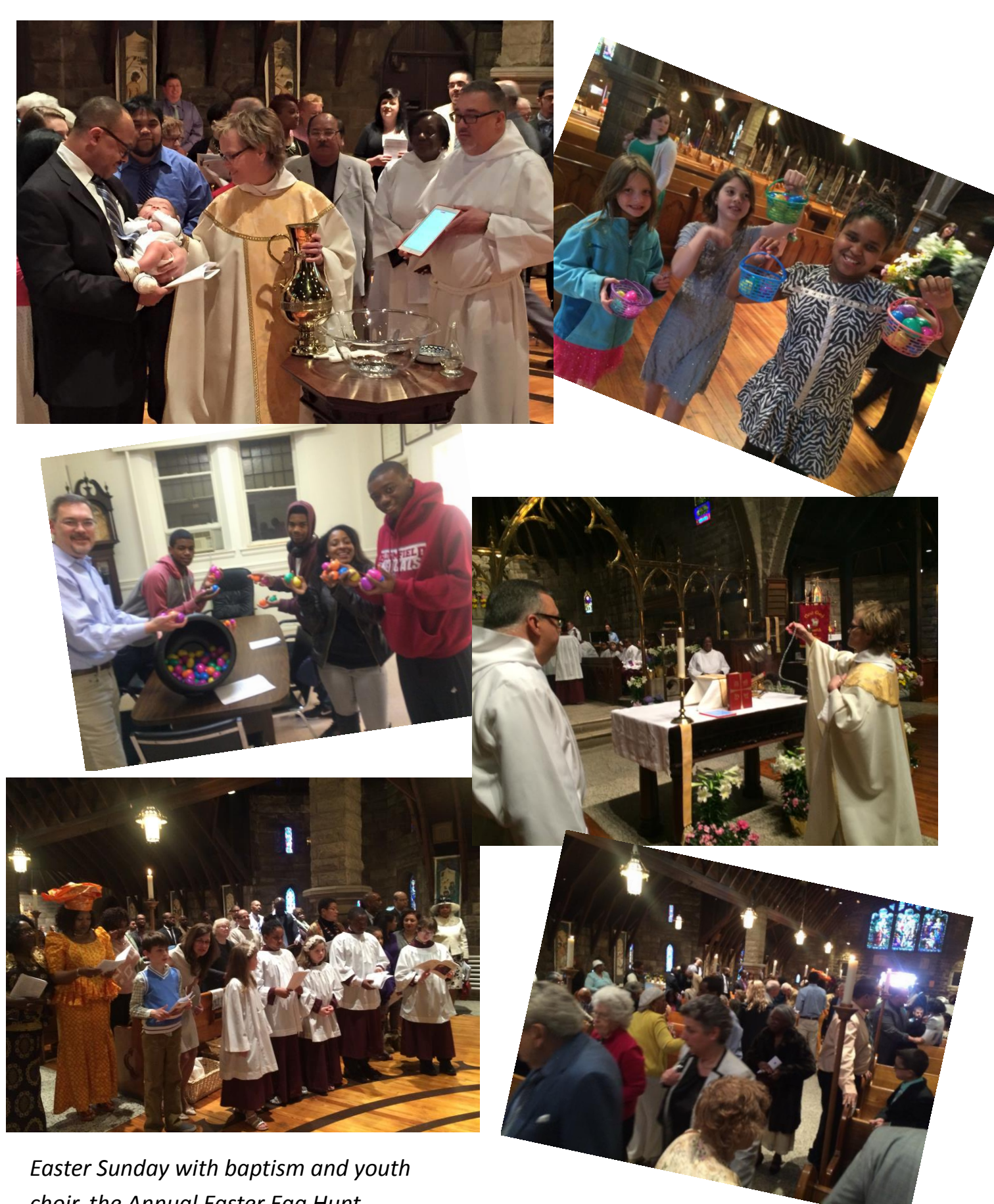
choir, the Annual Easter Egg Hunt